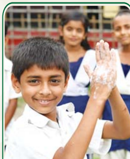
Improved Hygiene and Sanitation