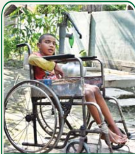
Gender Equity and Disability Inclusion