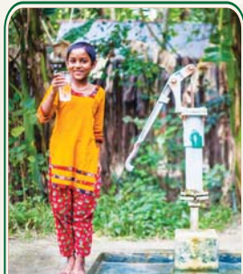
Safe Water Access