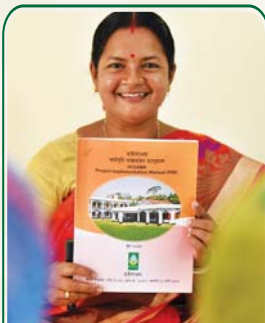
Capacity Development and Empowerment