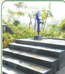
Climate Change Adaptation